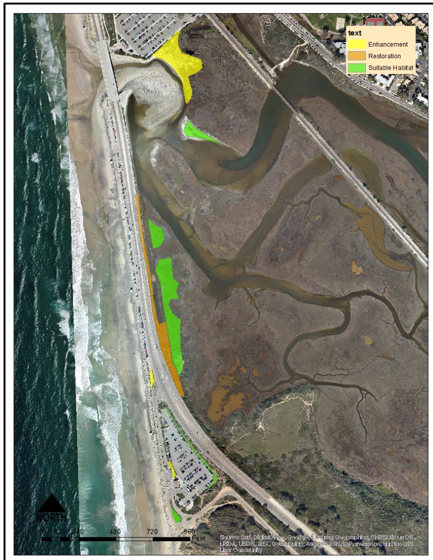
Figure 2. Populations of NULO in Torrey Pines State Natural Reserve and Los Peñasquitos Lagoon from field surveys conducted by California State Parks (CSP) between 2014-2016. Graphic includes areas of suitable habitat for NULO and potential restoration areas for native transitional species to reduce presence of invasive species adjacent to areas suitable for NULO expansion east of N. Torrey Pines Road.